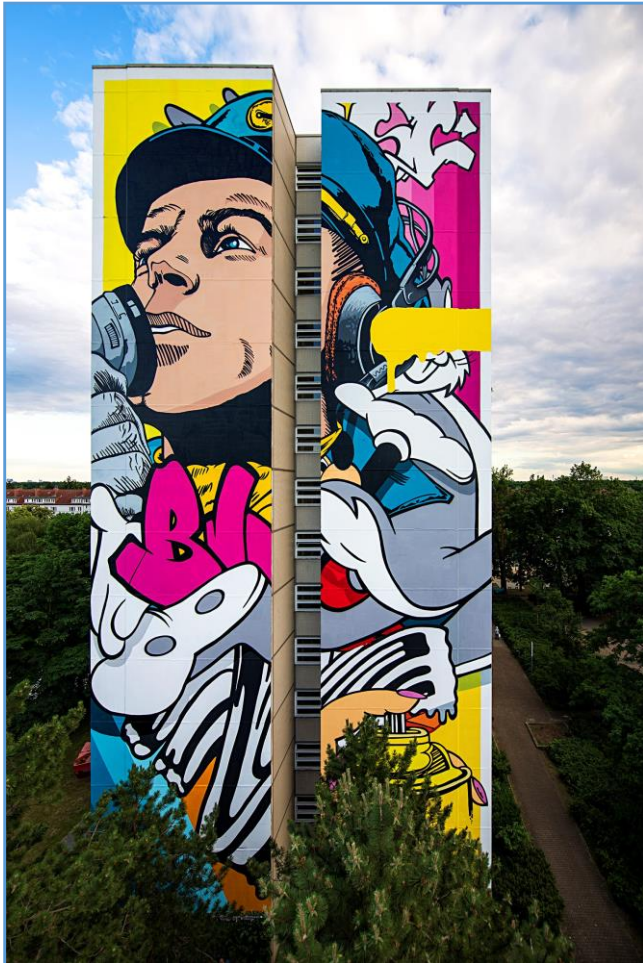
The 43 x 16 metre facade of Neheimer Strasse 4.

Graffiti pop at Artpark Tegel. Giant collage commemorates "Otto Lilienthal" airport.