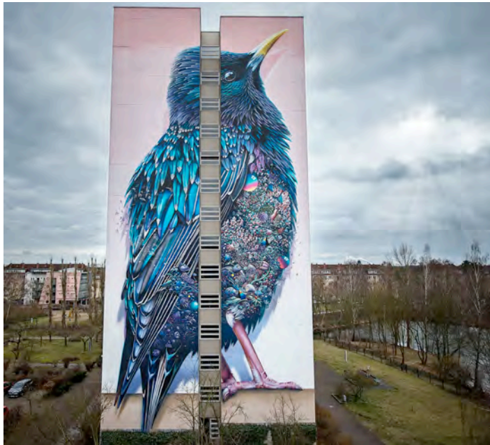
The starling sprayed by the artists Collin van der Sluijs and Super A in Reinickendorf is 42 metres high.

The two street artists Collin van der Sluijs and Super A gave a little bird a taste of the big time on the wall of Neheimer Strasse 6 in Reinickendorf. The two Dutchmen sprayed a giant starling onto the back wall, which measures over 42 metres in height.